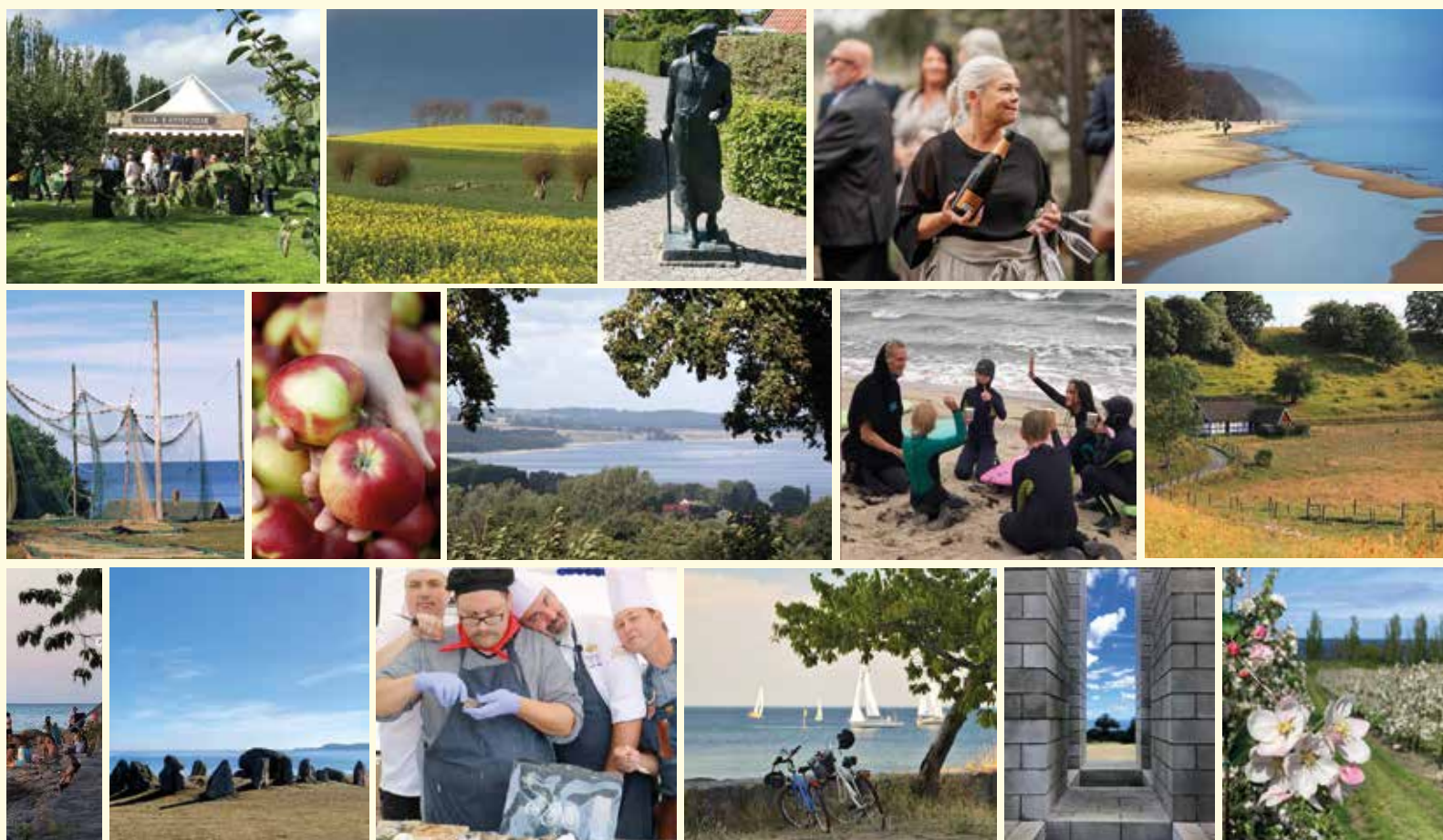
Several of these pictures come from Kiviks Turism's photo competition on Instagram. All pictures are from the beautiful local surroundings at Kivik.